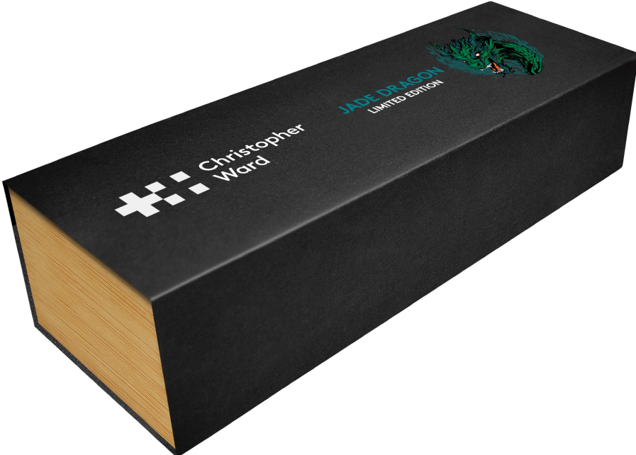
Image shows an illustrative box, as Jade Dragon will arrive in the new style box. Photographs of the actual new box were not available at the date this document was created.