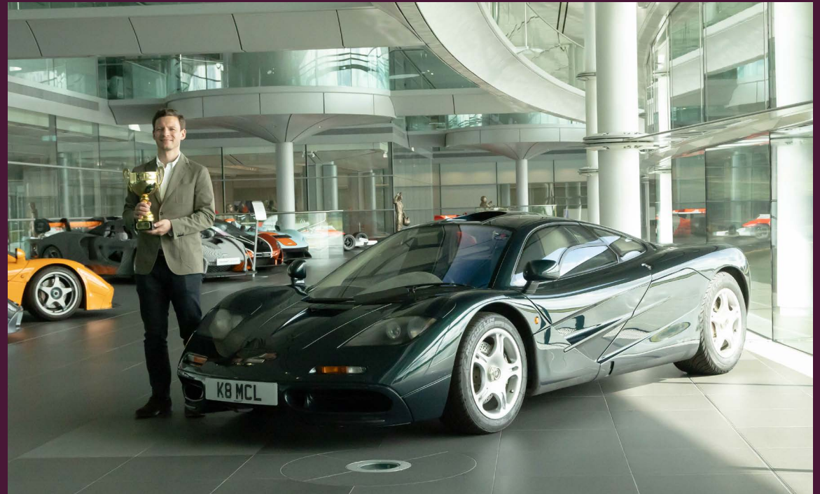
McLaren F1 - Winner of the Supercar Heritage Trophy 2024