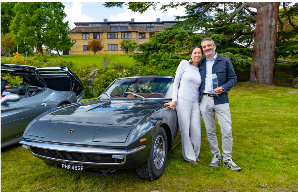
Winners of the 2024 Public Choice